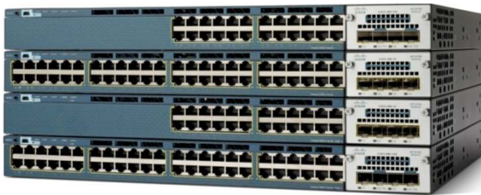
Figure 2. Cisco Catalyst 3560-X Series Switches

Figure 2 shows Cisco Catalyst 3560-X Series Switches.